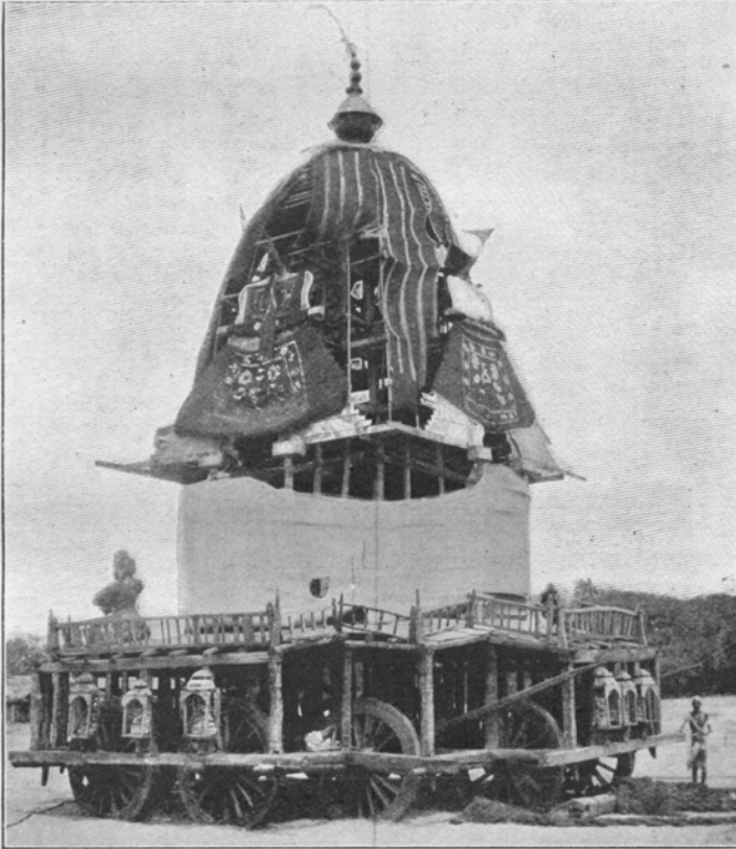
THE WHEELS OF THIS CAR CRUSHED THE LIFE OUT OF HUNDREDS OF DEVOTEES IN THE OLD DAYS.

The next photo. reproduced gives us a splendid view of the scene presented on the first of these occasions. In the background the temple of Juggernath raises its lofty head, standing in its own walled inclosure. Behind is a forest of palms and mangoes; while the foreground is made up of a veritable sea of human beings, relieved only by a few booths and a sprinkling of carriages.