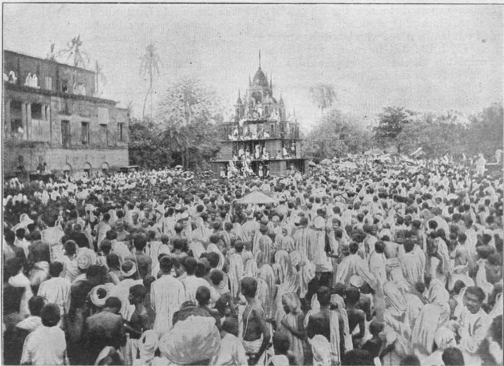
READY FOR THE SIGNAL TO PULL THE GREAT CAR—"FROM A WORLDLY POINT OF VIEW IT IS A GRAND SIGHT."

result in surreptitious loss of life beneath the wheels of the great car, as in the olden days, when the natives positively vied with one another in casting themselves beneath the wheels, and the car left a hideous track of mangled corpses behind it. Moreover, the magistrate has to see that the hauling ropes are sufficiently