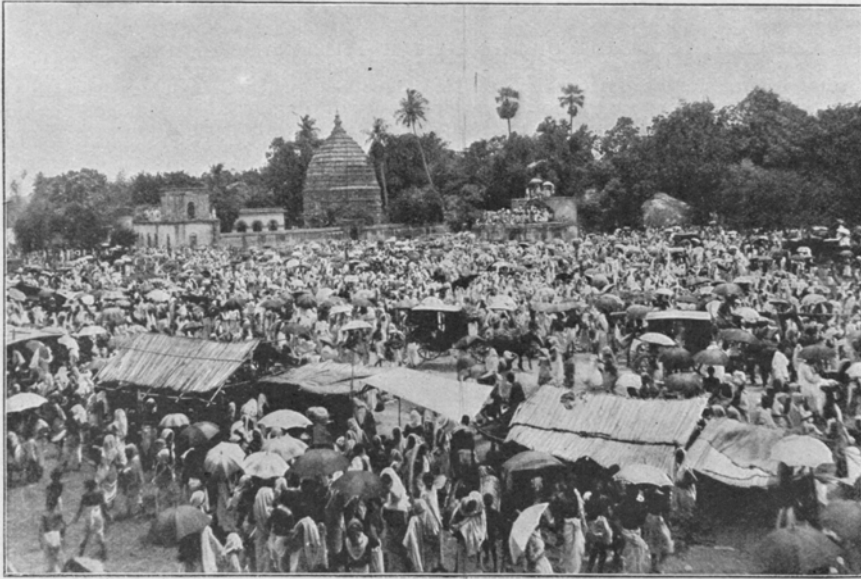
"A VERITABLE SEA OF HUMAN BEINGS, RELIEVED ONLY BY A FEW BOOTHS AND CARRIAGES."

As the sun is blazing down with all its Indian fervour, those natives possessing umbrellas have prudently put them up. Every person present is on the tip-toe of excitement and expectation, waiting for the ceremony to commence. All eyes are turned towards the platform of brick and masonry at the rear, where the great function is taking place that has attracted all these multitudes. The fact is, Juggernath is receiving his annual public bath.