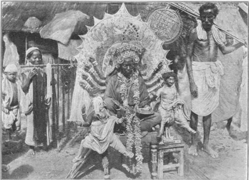
A LIVING GODDESS—WHO IS ALSO A BEGGAR—THE WOMAN IS GOT UP TO REPRESENT THE MIGHTY TEN-ARMED DOORGA, WITH HER SONS GANESH AND KARTIK.

But, you will ask, has she anything to give in return for the offerings? Why, yes, of course. She pours forth all kinds of blessings upon the heads of her benefactors, who fondly imagine that good wishes of this kind are as efficacious as if they proceeded from the real goddess herself. And, of course, they are.